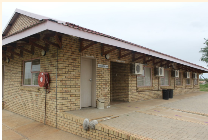
Transport section at Maphuta Malatjie Hospital