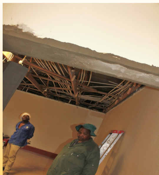
X-ray rooms at Letaba Hospital