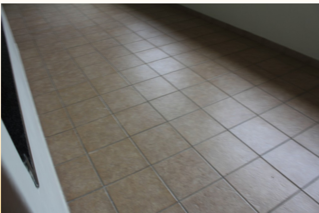
Floor tiles at residential