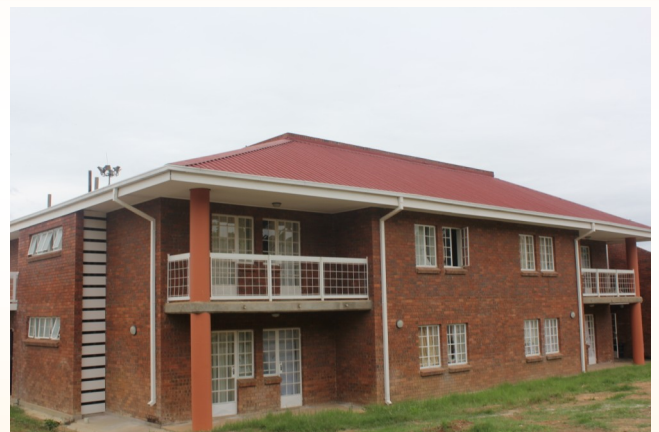
Residential accommodation for nurses