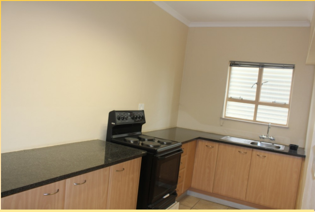
Renovated kitchen at Letaba Clinic