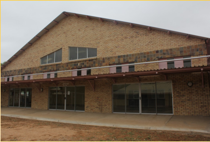
Kitchen at Maphuta Malatjie Hospital