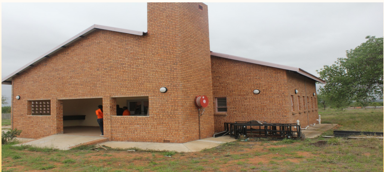
Gym centre at Maphuta Malatjie Hospital