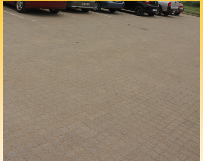
Paving at Letaba Hospital