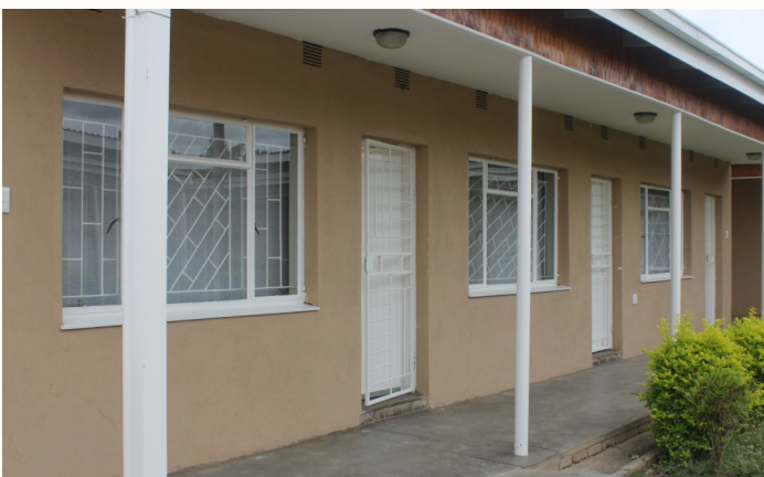
Nurse college Centre room

Limpopo Department of Public Works renovated nursing college centre and 17 residential houses for nurses at Letaba Hospital. Also the Maphutha Malatjie Hospital received the transport section block, the kitchen, gym centre and renovation of workshop for the hospital.