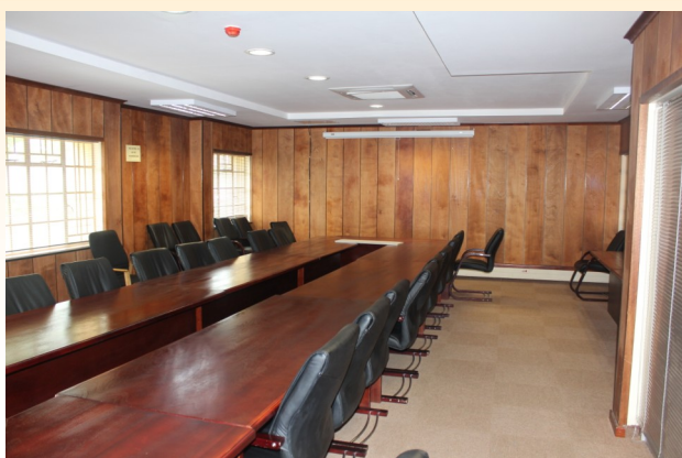
Newly built Boardroom at Letaba Hospital