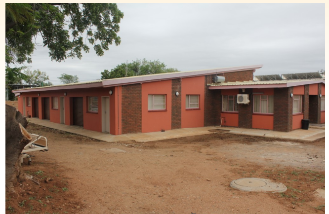
Renovated workshop at Maphuta Malatjie