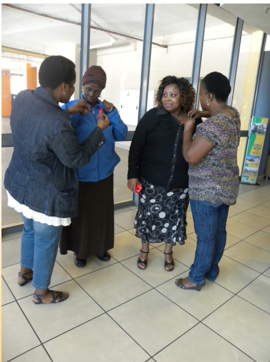
Employees taking part in the red ribbon awareness campaign.