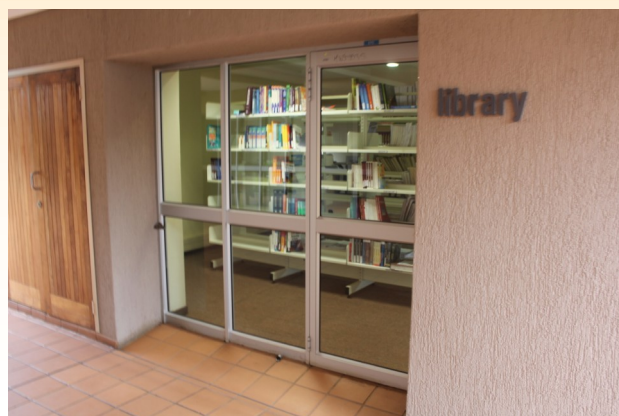
New library at Letaba Hospital